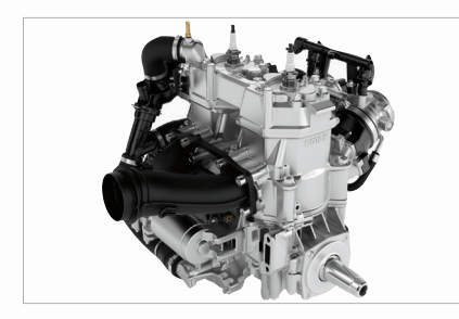
3 600 EFI – 40 and 55 engines

Plenty of horsepower kick for a variety of experience levels and a truly high degree of reliability and ease of use with this electronic fuel injection two-stroke. Standard with electric start.