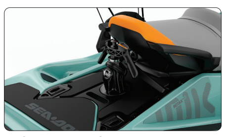
LinQ Retractable Ski Pylon A quick-install retractable ski pylon that stows away when not in use. Features spotter hand grips and rope storage.

Five preset acceleration profiles make it easy to deliver a smooth launch and maintain consistent pace.