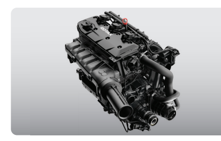
Rotax<sup>®</sup> 1630 ACE<sup>™</sup> - 170 Engine The Rotax<sup>®</sup> 1630 ACE<sup>™</sup> - 170 combines plenty of naturally aspirated power and economy, meaning the adventure can be exhilarating and prolonged.