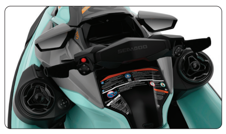
BRP Audio – Premium System (optional) An industry-first manufacturer-installed truly waterproof Bluetooth<sup>†</sup> audio system.

This moderate V-shaped hull guarantees a stable, enjoyable ride in variable water conditions. Confident, predictable handling but incredibly playful when you want it to be.