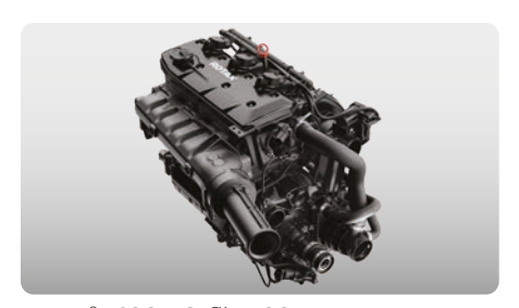
Rotax® 1630 ACE™ - 130 Engine

Exclusive to Sea-Doo®, iBR stops the watercraft sooner and provides more control and maneuverability at low speeds and in reverse.