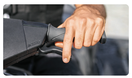
iBR® – Intelligent Brake & Reverse Exclusive to Sea-Doo<sup>®</sup>, iBR stops the watercraft sooner and provides more control and maneuverability at low speeds and in reverse.