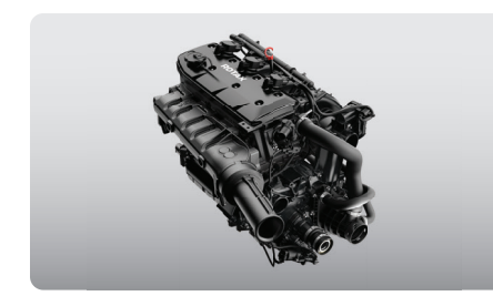
Rotax<sup>®</sup> 1630 ACE<sup>™</sup> – 130 Engine The powerful and reliable naturally aspirated 1630 ACE<sup>™</sup> – 130 is all about fun and acceleration while providing excellent fuel efficiency.