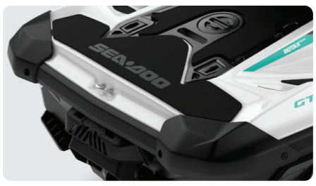
Swim Platform With Integrated LinQ System Exclusive quick-attach system on a large swim platform that allows for easy installation of accessories.