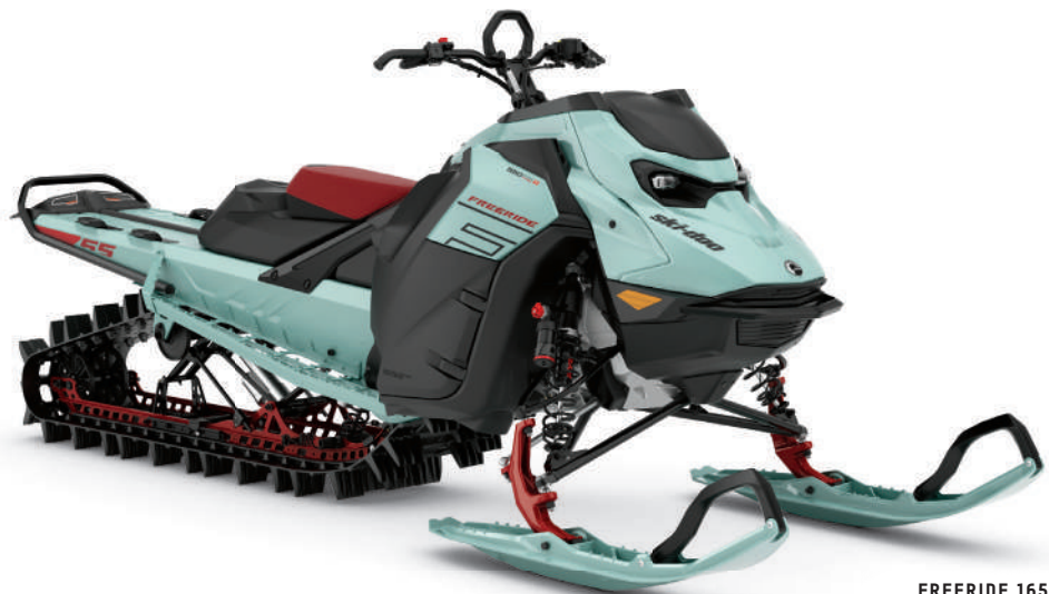
FREERIDE 165 850 E-TEC TURBO R SHOWN