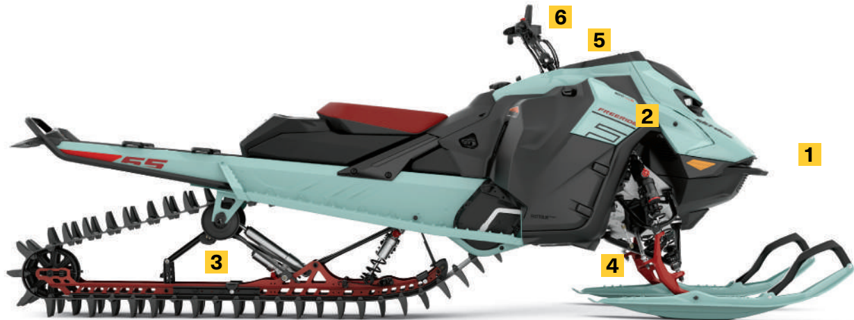
FREERIDE 165 850 E-TEC TURBO R SHOWN

In addition to 3 lb of weight savings and increased capacity, the tMotion XT dons a locked rear arm for more rigidity in technical maneuvers.