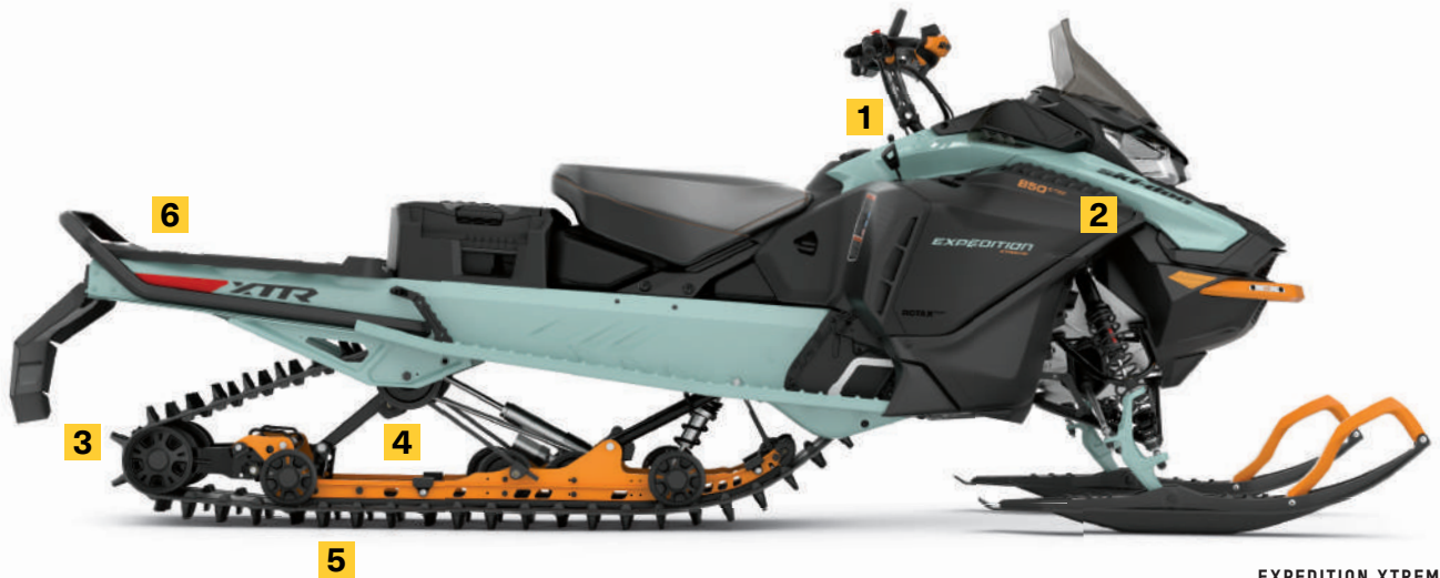
EXPEDITION XTREME 850 E-TEC SHOWN

The REV Gen4 platform paired with the RAS X crossover front suspension allows effortless maneuvers in deep-snow, while the 20 x 154 x 1.8 in. Cobra track provides incredible flotation and traction.