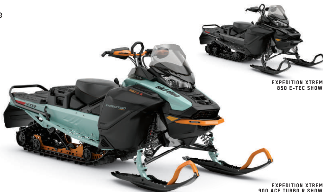
EXPEDITION XTREME 850 E-TEC SHOWN

The high-performance sport-utility sled with capability to go just about anywhere.