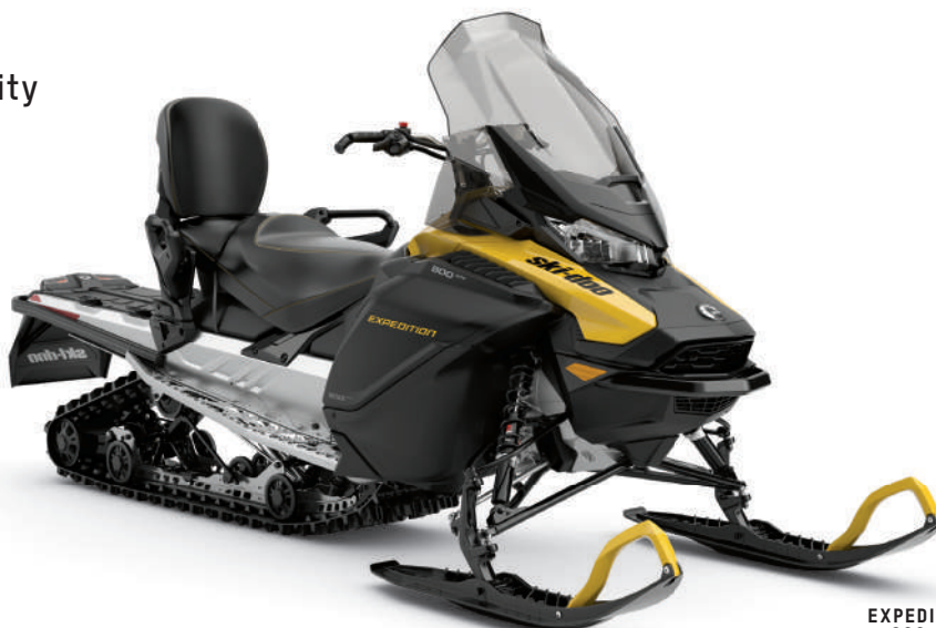
EXPEDITION SPORT 900 ACE SHOWN

Ultra-responsive chassis for on- or off-trail rides and extensive array of sport-utility and 2-up features.