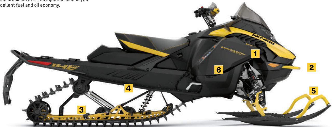
BACKCOUNTRY ADRENALINE 146 850 E-TEC SHOWN

Completely new lighter design is better balanced for performance on- and off-trail. Perfectly balanced weight transfer for an increased fun factor and more travel for more comfort and bump absorption.