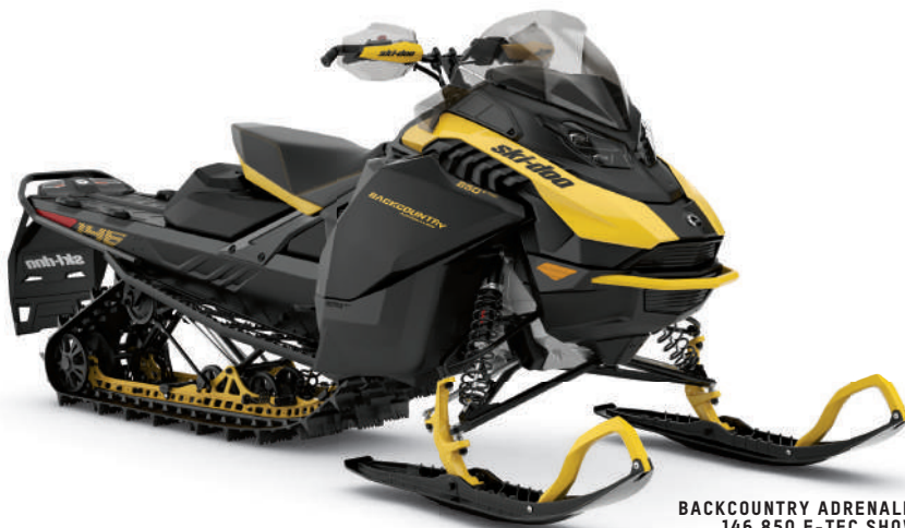
BACKCOUNTRY ADRENALINE 146 850 E-TEC SHOWN