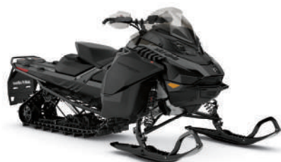
BACKCOUNTRY ADRENALINE 600R E-TEC SHOWN

Loaded with crossover-specific features for spending equal time riding on- or off-trail.