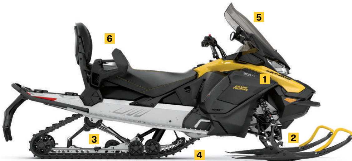
GRAND TOURING SPORT 900 ACE SHOWN

High-quality KYB† high-pressure gas shock for excellent performance and reliability.