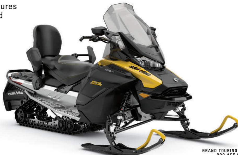
GRAND TOURING SPORT 900 ACE SHOWN

Trail comfort and 2-up features with precision handling and savvy style.