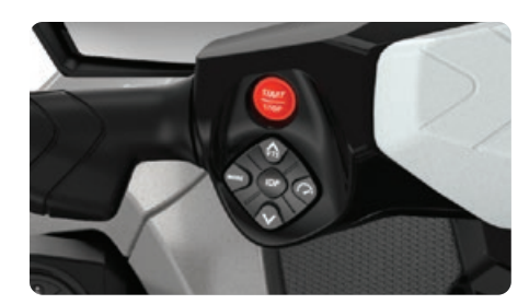
Pump System An innovative, industry-first system that allows you to free your pump of weeds and debris with intuitive handlebar-activated controls.