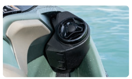
BRP Audio – Premium System The industry's first manufacturer-installed truly waterproof Bluetooth† audio system.