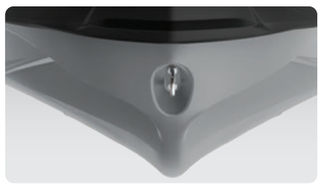
An innovative hull that sets the benchmark for rough water handling, stability and offshore performance.