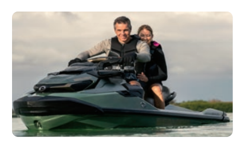
Limited Package USB port, watercraft cover, storage bin organizer, knee pads, exclusive coloration and more.