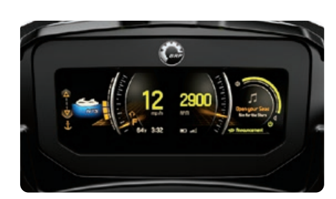
Full-Color 7.8" Wide Display Full-color display with incredible visibility and a new level of functionality. Bluetooth and smartphone app integration provides music, weather, navigation and more.

©2022 Bombardier Recreational Products Inc., (BRP). All rights reserved. ®, TM and the BRP logo are trademarks of Bombardier Recreational Products Inc. or its affiliates. Products are distributed in the USA by BRP US Inc. All product comparisons, industry and market claims refer to new sit-down PWC with 4-stroke engines. Watercraft performance may vary depending on, among other things, general conditions, ambient temperature, altitude, riding ability and rider/passenger weight. Testing of competitive models done under identical conditions. Because of our ongoing commitment to product quality and innovation, BRP reserves the right at any time to discontinue or change specifications, price, design, features, models or equipment without incurring any obligation. GTX is a trademark of Castrol Limited used under license. †Bluetooth is a registered trademark owned by Bluetooth SIG, Inc. and any use of such trademarks by BRP is under license. Printed in Canada.