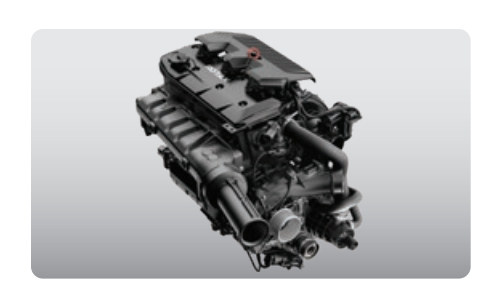
Rotax® 1630 ACE™ – 300 Engine The Rotax 1630 ACE – 300 is the most powerful Rotax engine ever, delivering high efficiency and best-in-class acceleration.