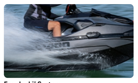
Ergolock™ System A narrow seat profile with deep knee pockets lets riders sit naturally and use the lower body to hold onto the machine for more control.