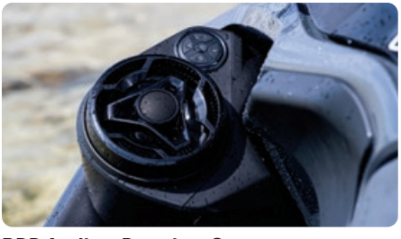
BRP Audio – Premium System The industry's first manufacturer-installed truly waterproof Bluetooth<sup>†</sup> audio system.