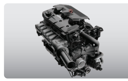
Rotax® 1630 ACE <sup>™</sup> - 300 Engine The Rotax 1630 ACE - 300 is the most powerful Rotax engine ever, delivering high efficiency and best-in-class acceleration.