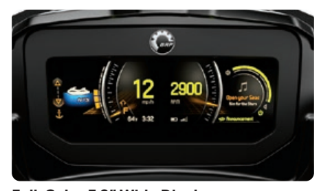
Full-Color 7.8" Wide Display Full-color display with incredible visibility and a new level of functionality. Bluetooth<sup>†</sup> and smartphone app integration provides music, weather, navigation and more.