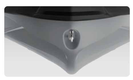
ST3 Hull <sup>™</sup> An innovative hull that sets the benchmark for rough water handling, stability and offshore performance.