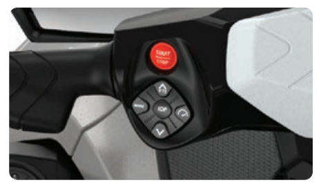
iDF – Intelligent Debris-Free system An innovative, industry-first system that allows you to free your pump of weeds and debris with intuitive handlebar-activated controls.

©2022 Bombardier Recreational Products Inc., (BRP). All rights reserved. (a), TM and the BRP logo are trademarks of Bombardier Recreational Products Inc. or its affiliates. Products are distributed in the USA by BRP US Inc. All product comparisons, industry and market claims refer to new sit-down PWC with 4-stroke engines. Watercraft performance may vary depending on, among other things, general conditions, ambient temperature, altitude, riding ability and rider/passenger weight. Testing of competitive models done under identical conditions. Because of our ongoing commitment to product quality and innovation, BRP reserves the right at any time to discontinue or change specifications, price, design, features, models or equipment without incurring any obligation. †Bluetooth is a registered trademark owned by Bluetooth SIG, Inc. and any use of such trademarks by BRP is under license. Printed in Canada.